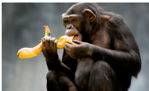
Chimp Haven, Keithville, LA Over 300 chimpanzees reside at 200-acres nonprofit sanctuary.