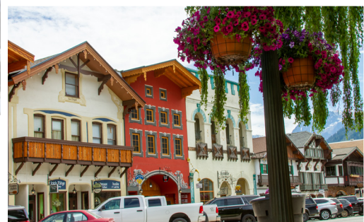
Leavenworth, WA Bavarian-styled village in the Cascade Mountains of central Washington.