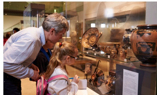
Berman Museum of World History, Anniston, AL Museum holds over 6,000 pieces of art, antiquities, arms and armor.

Enjoy your adventures and when you return from your travels, I'll be here to answer any questions you may have about the market!