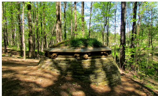
Cloud Chamber for the Trees and Sky, Raleigh, NC Outdoor art installation features a camera obscura.