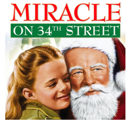
Miracle on 34th Street