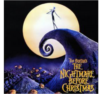
Tim Burton's The Nightmare Before Christmas