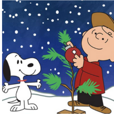
A Charlie Brown Christmas