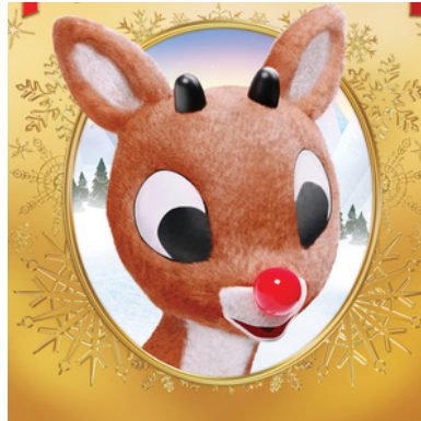
Rudolph, the Red Nosed Reindeer