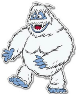
Bumble the Abominable Snowman