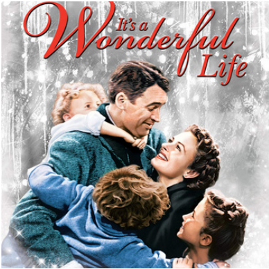
It's a Wonderful Life