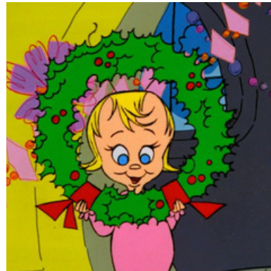
Cindy Lou Who