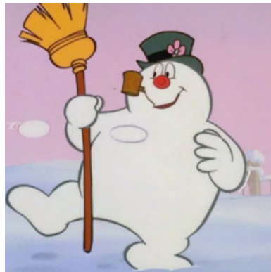
Frosty the Snowman