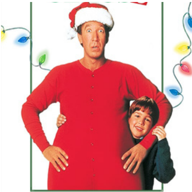
The Santa Clause