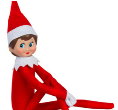
Elf on the Shelf