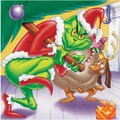
Dr. Seuss' How the Grinch Stole Christmas