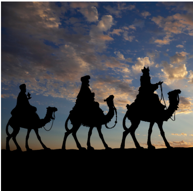
Three Wise Men