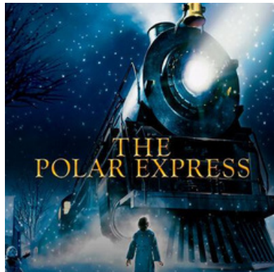
The Polar Express