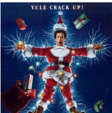
National Lampoon's Christmas Vacation