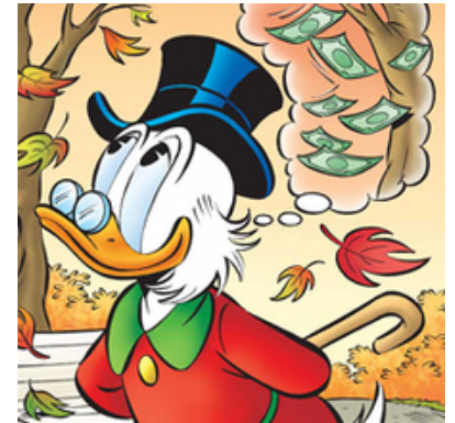
Scrooge McDuck/Ebenezer Scrooge