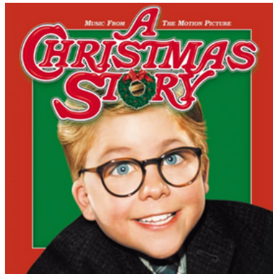
A Christmas Story