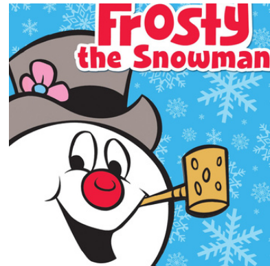
Frosty the Snowman